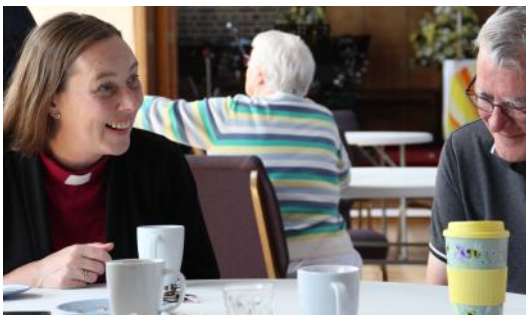
Some 'down time' amongst new friends on announcement day, at St Mark's, Bessingby, Bridlington