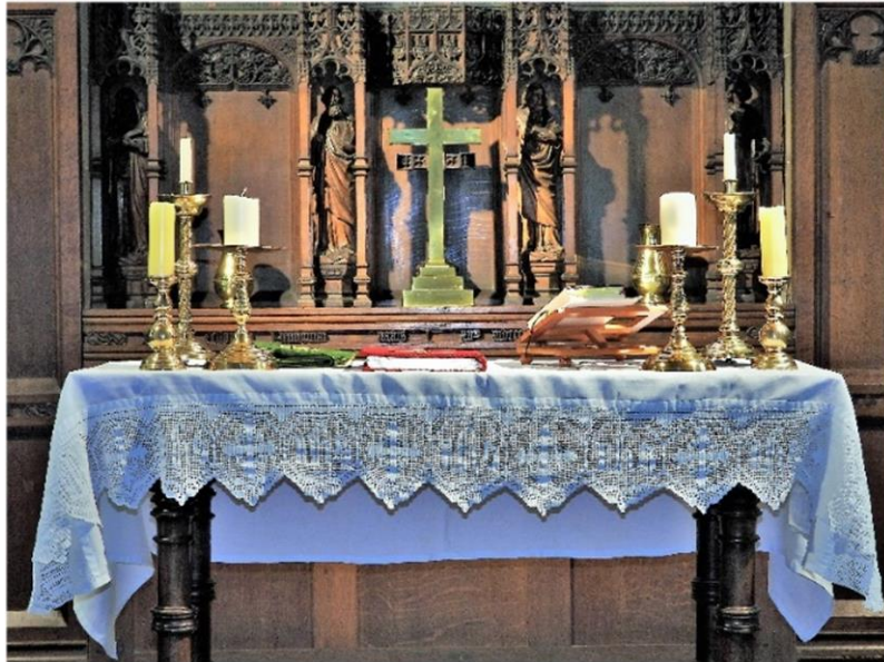
Altar all prepared