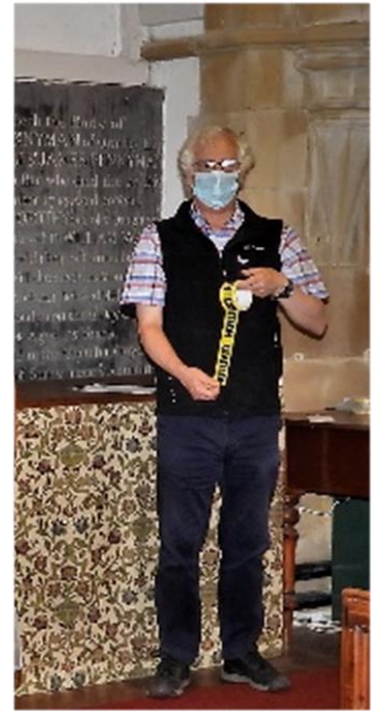
Anyone got a tape measure?