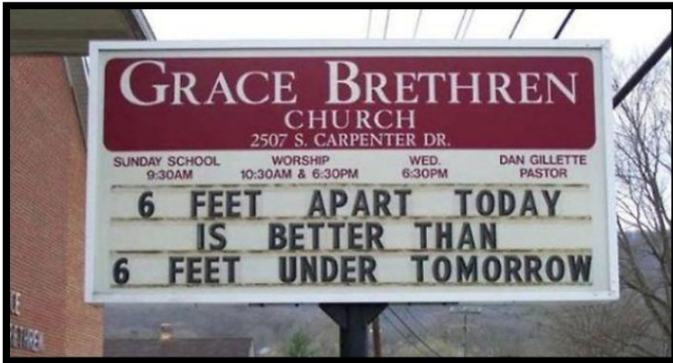
Thanks to Google for church signs.