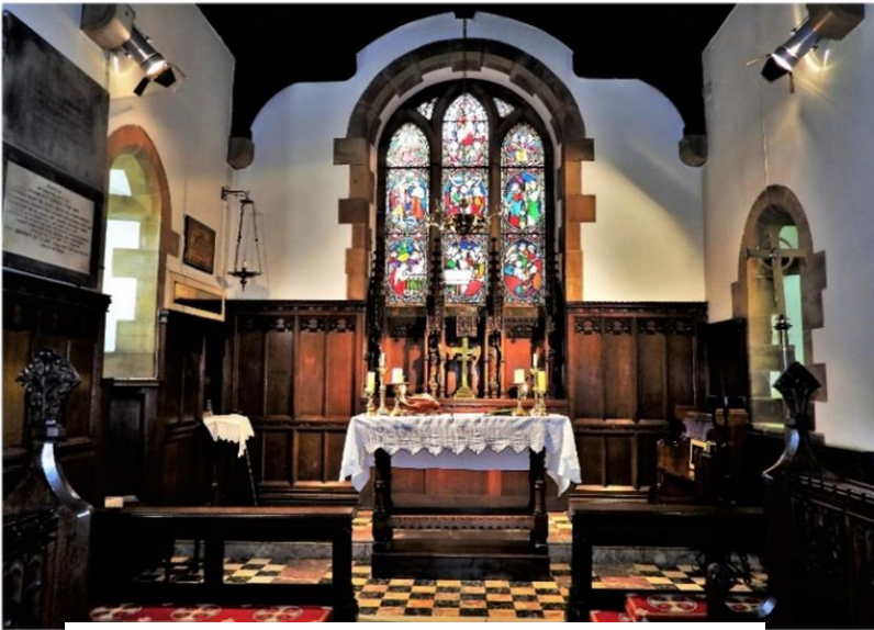
The sparkling sanctuary